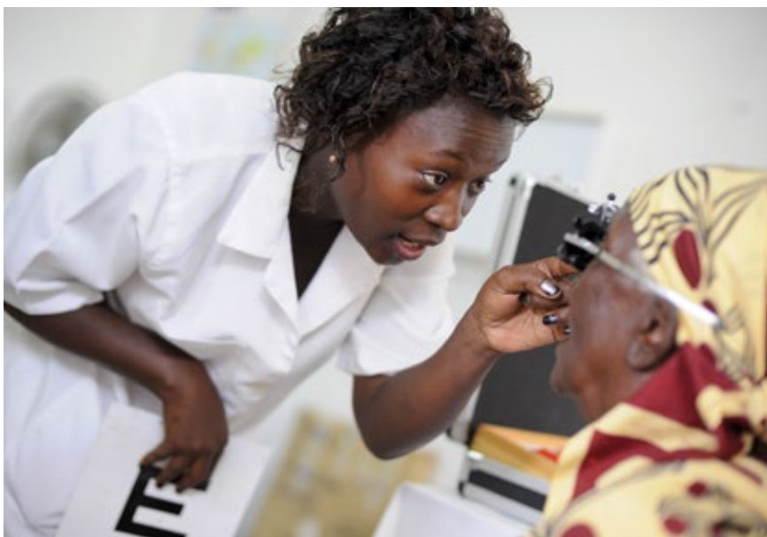
Refractive error examination. MOZAMBIQUE

Near visual acuity charts. Near vision charts can consist of paragraphs of text with different font sizes, or they can consist of lines of numbers or tumbling Es in different sizes. These are used to check near vision at a normal near working distance for the patient (typically 40 cm).