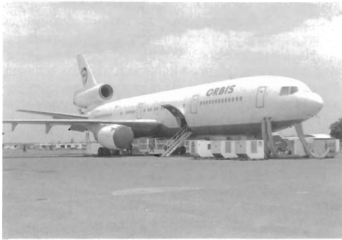
Figure 1 The ORBIS Flying Eye Hospital is a fully operational DC-10 aircraft that contains a state-of-the-art teaching hospital for ophthalmic surgery.

trative office, conference room, technical services area in the aircraft belly (see Figure 7), and a modular electrical and air-handling system outside the plane (see Figure 8).