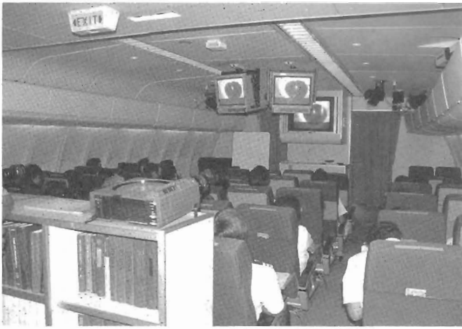
Figure 3 The classroom seats up to 52 doctors who watch and actively participate in live surgeries via a two-way, audio-visual system.

truck. Moreover, two uninterruptable power supplies (UPS) continuously power essential equipment (such as the operating microscope, anesthesia machine and ventilator, patient monitors, telephone system, and computer network server).