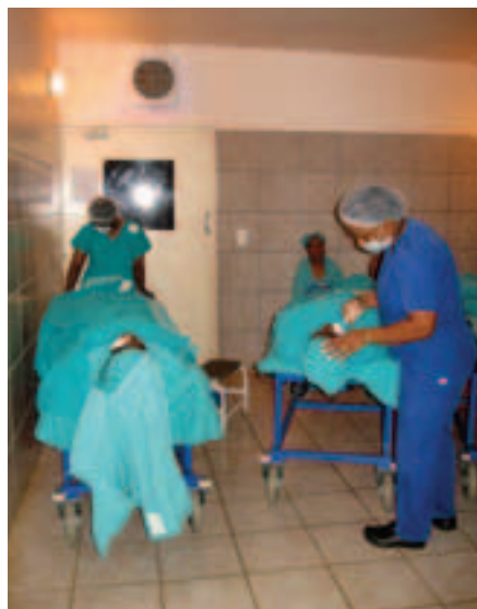
One patient recovers after the operation while another is given local anaesthetic. SWAZILAND

Because this mobile operating table can transport the patient between the different areas before, during, and after an operation, the patient can stay on the table throughout and does not have to transfer beds. Four tables are in use at any one time: one for a patient being prepared for surgery, one for a patient being given local anaesthetic, one for a patient being operated on, and one for a patient being wheeled out of the OR and returned to the ward.