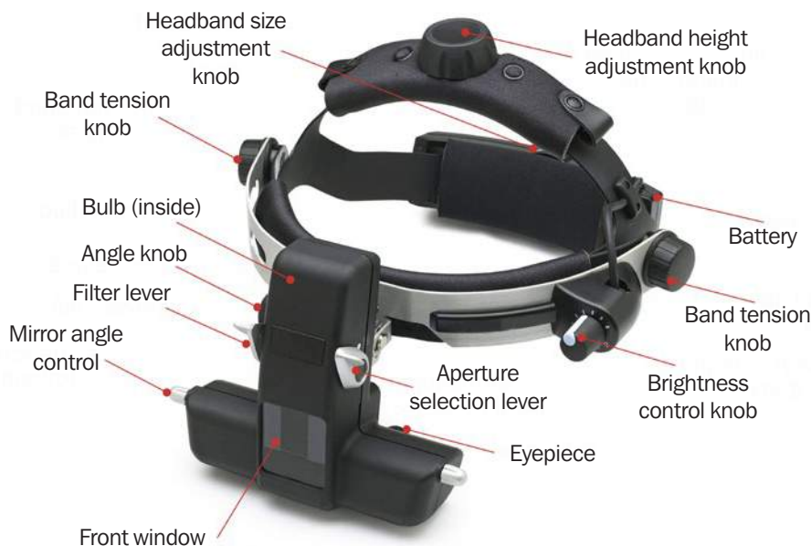
Figure 2. Indirect ophthalmoscope viewing system