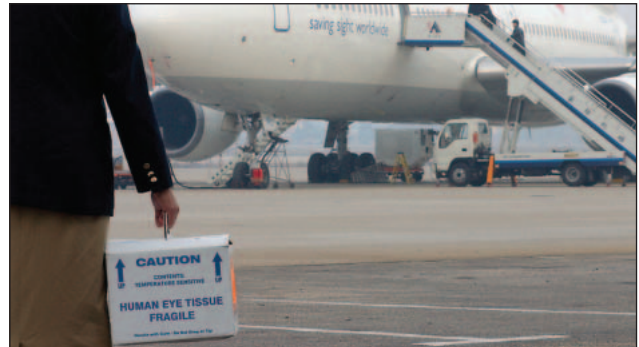
An ORBIS volunteer ophthalmologist carries donated corneas to the flying eye hospital.