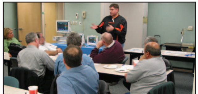
Philips Medical Systems was among the presenters at TABETA's January meeting.